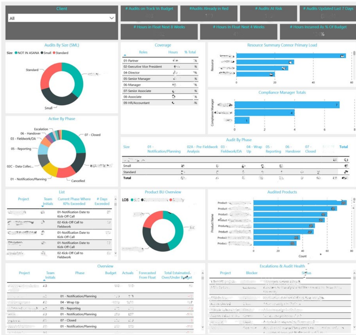
Sample Dashboard View